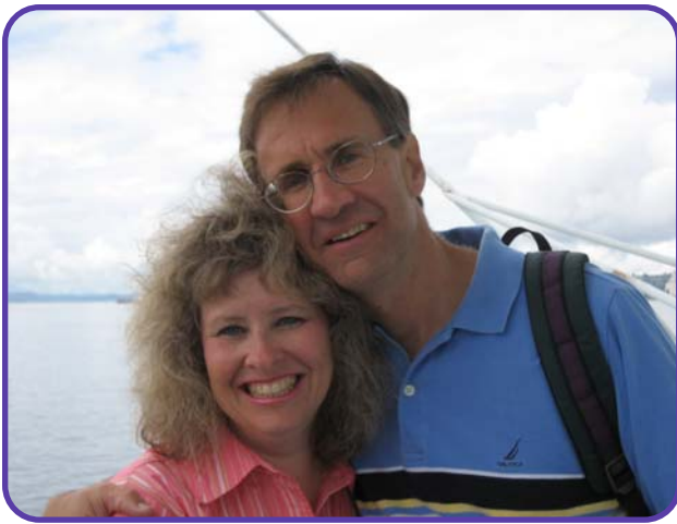
Enjoying a boat cruise in the San Juan Islands