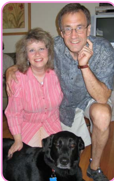
With our beloved black lab, Sammy