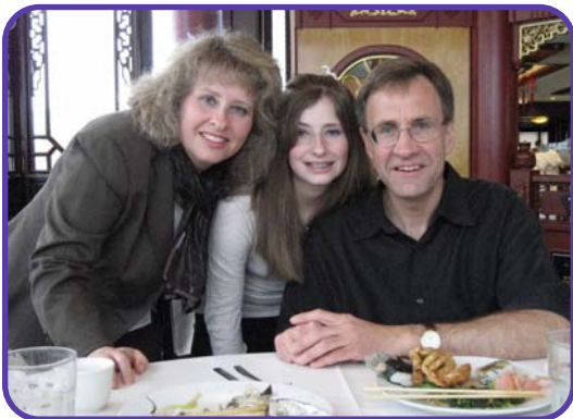
Dining at our favorite Asian restaurant

company. I had to stand up in front of 1000 people and give a short speech. I talked about the sacrifice my husband made and broke down in grateful tears on the podium.