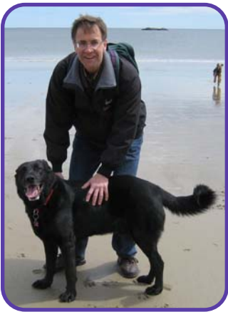
Walking Sammy on a nearby beach